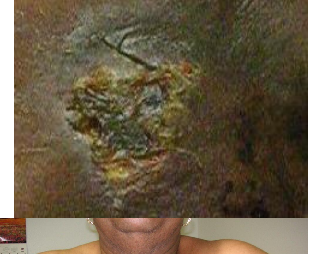
Day 17: Significantly improved wound healing and reduction of MRSA