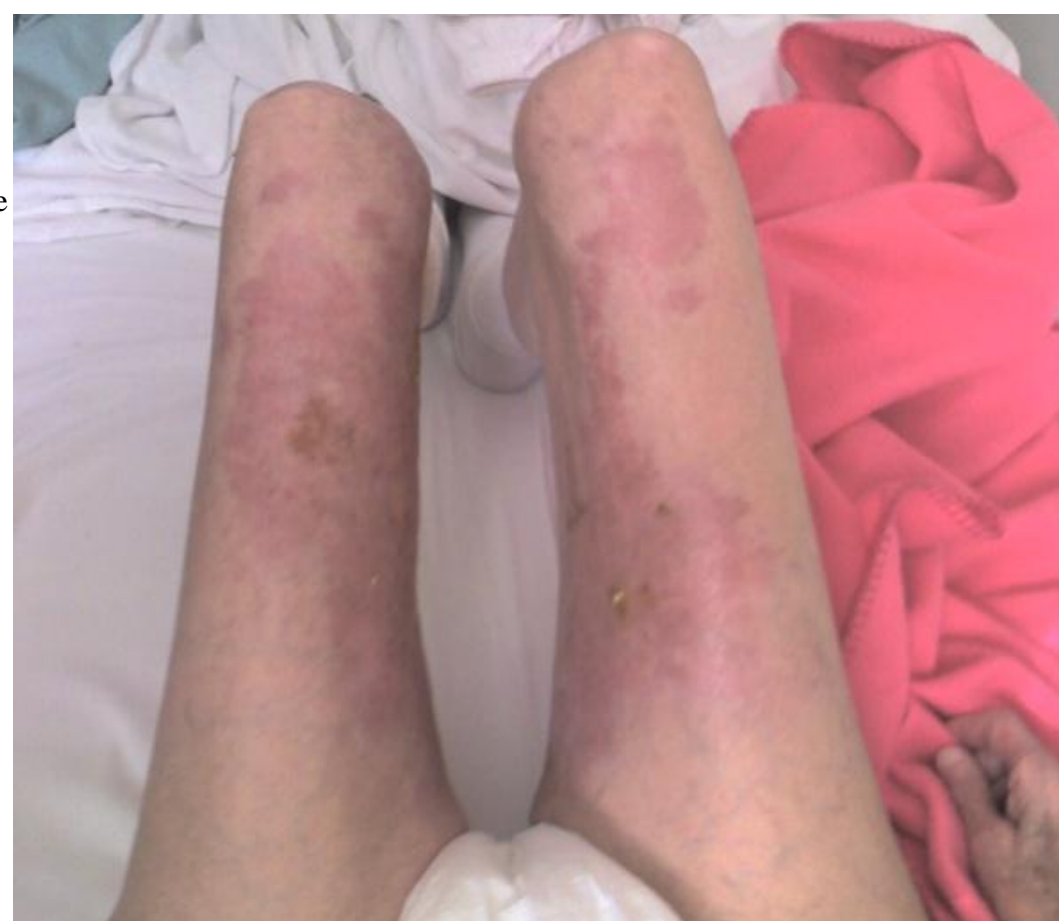
Day 65: Complete healing with no infection. The wound is discolored but relatively scarfree after 65 days.